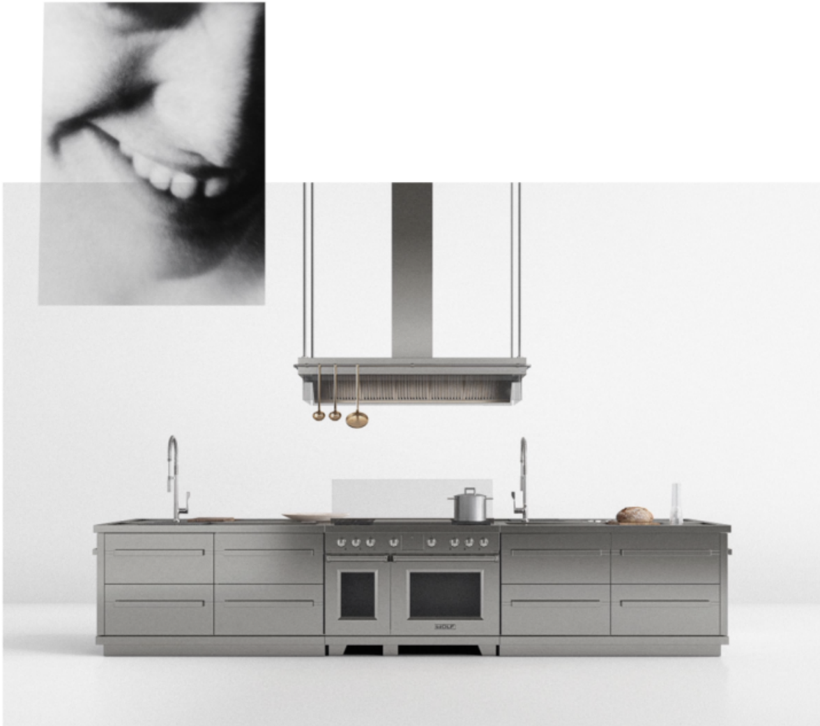
Proxima, 2024. Design Antonio Citterio

100 YEARS OF EXTRAORDINARY KITCHEN DESIGN, AND EVERYDAY CONNECTIONS. A FUTURE FULL OF STORIES YET TO UNFOLD.