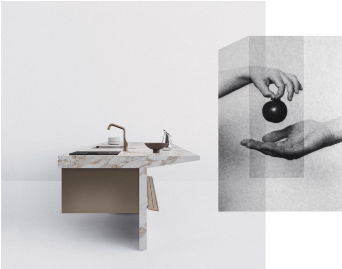
Lignum et Lapis, 2008. Design Antonio Citterio

100 YEARS OF EXTRAORDINARY KITCHEN DESIGN, AND EVERYDAY CONNECTIONS. A FUTURE FULL OF STORIES YET TO UNFOLD.