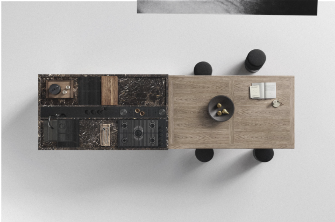
Convivium, 2002. Design Antonio Citterio