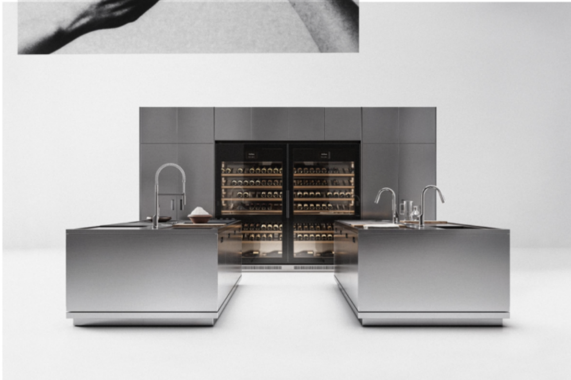
Italia, 1988. Design Antonio Citterio